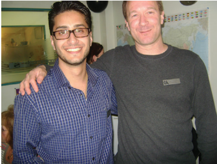
StreetSmarts facilitators - the "awesome guys"

Funding for StreetSmarts has been provided by the Ministry of Justice, Coast Capital Savings, the Betty Averbach Foundation, the City of Richmond and CIBC.