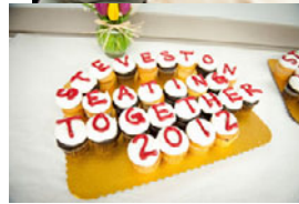
Wrap-Up Dinner at the Steveston Community Centre