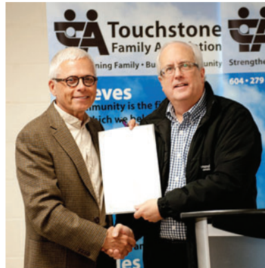
Mayor Malcolm Brodie Proclaiming Family Day

100% of funds raised are used in the Front Porch Program to sustain barrier free counselling hours. Counselling is available to families without the red tape, time and disclosure that is required by referrals.