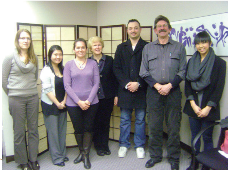
Restorative Justice Volunteers

Funded by the City of Richmond, the Richmond Restorative Justice Program serves members of the community who have been affected by a crime or incident. The program is targeted at young offenders who have committed less serious offences. Forums bring together victim and offender with family supporters to agree on appropriate restitution. The program has received close to 300 referrals since its inception, and it has dealt with various types of offences, including theft, assault and fraud, to name a few.