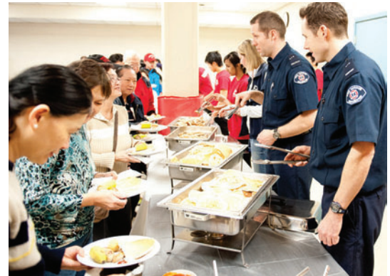
Kick-Off Breakfast served by Richmond Firefighters at the Thompson Community Centre